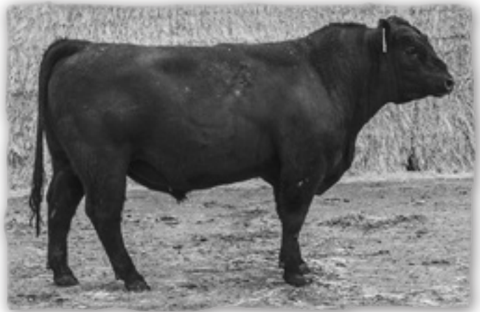
HD Dunn Charlo 7036 - Lot 26