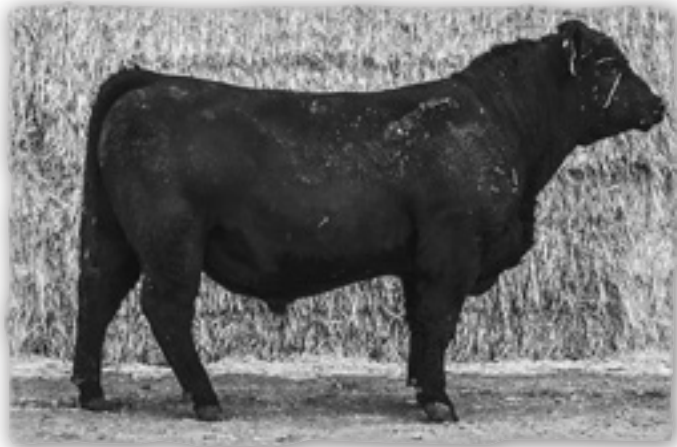
HD Dunn Absolute 7155 - Lot 8