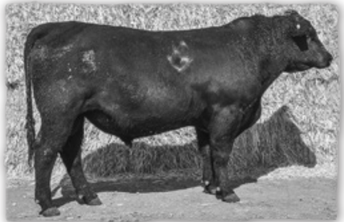
HD Dunn Ten X 7234 - Lot 12