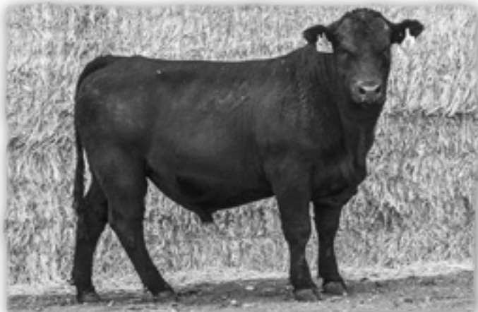
HD Dunn Ten X 7236 - Lot 11