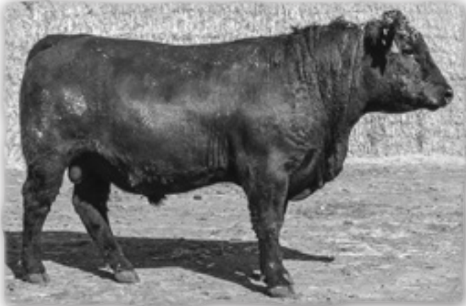
HD Dunn Final Answer 7413 - Lot 2