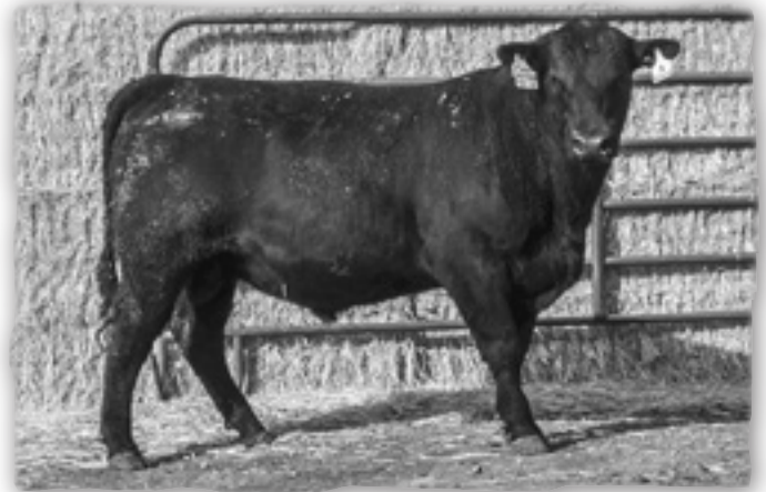
HD Dunn Pioneer 7322 - Lot 5