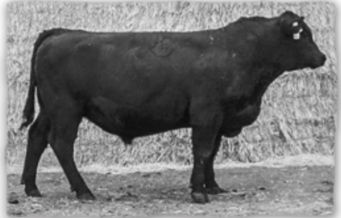
HD Dunn Final Answer 7186 - Lot 6