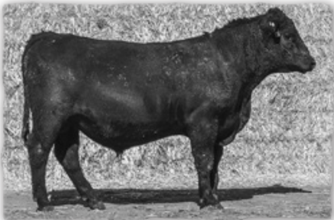
HD Dunn Absolute 7056 - Lot 4