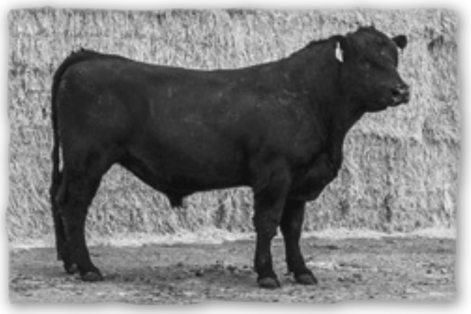
HD DUNN YELLOWSTONE E032 - Lot 111