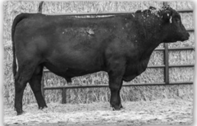
HD Dunn Ten X 7182 - Lot 13