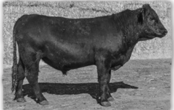
HD Dunn Charlo 7074 - Lot 53