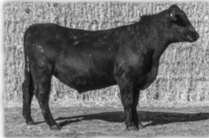
HD Dunn Pioneer 7213 - Lot 87