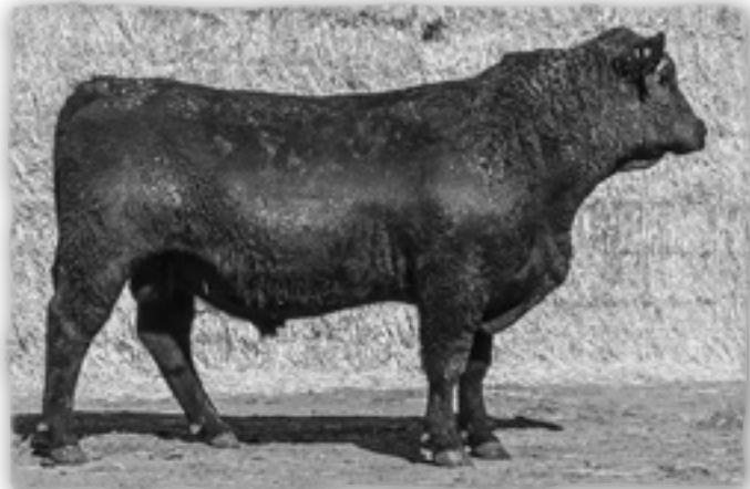
HD Dunn Absolute 7004 - Lot 9