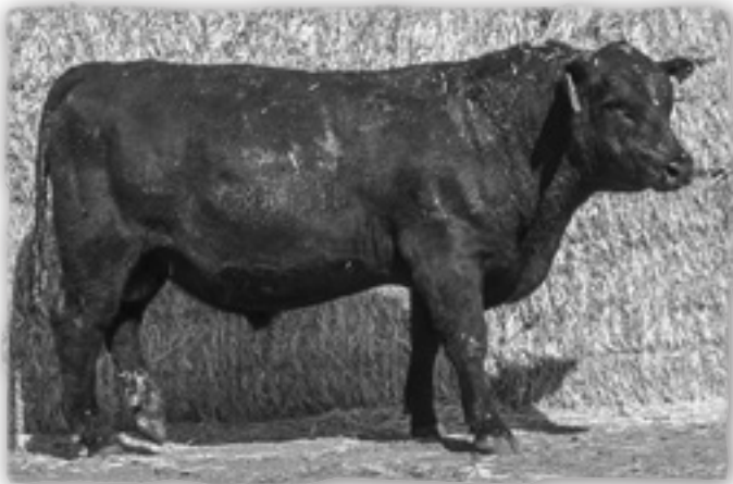
HD Dunn Pioneer 7215 - Lot 1