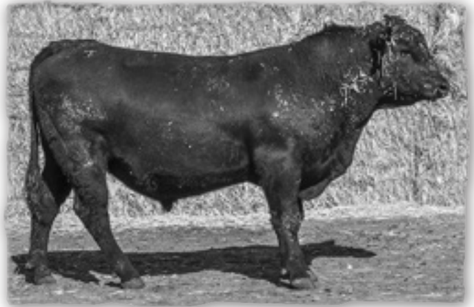
HD Dunn I87 Alliance 7288 - Lot 19