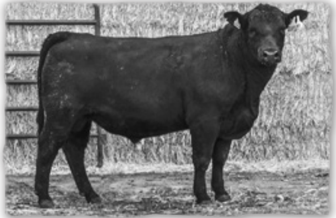
HD Dunn Game Day 7081 - Lot 33