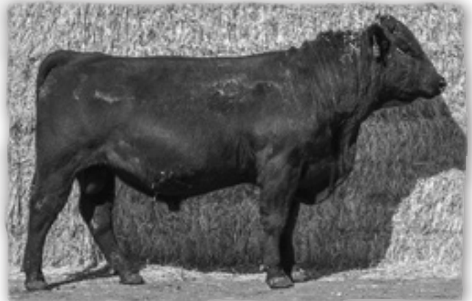
HD Dunn Ten X 7250 - Lot 14

Pick up your bulls or registered heifers within five days of the sale and receive a $75 credit per bull or heifer. Otherwise, there is a free delivery on the bulls and registered heifers to Idaho and adjoining states, including northern Colorado, with total purchases of $3,000 or more. Animals selling further away will be delivered at cost, guaranteed not to exceed $275 each. Buyers are responsible for the delivery of commercial heifers.