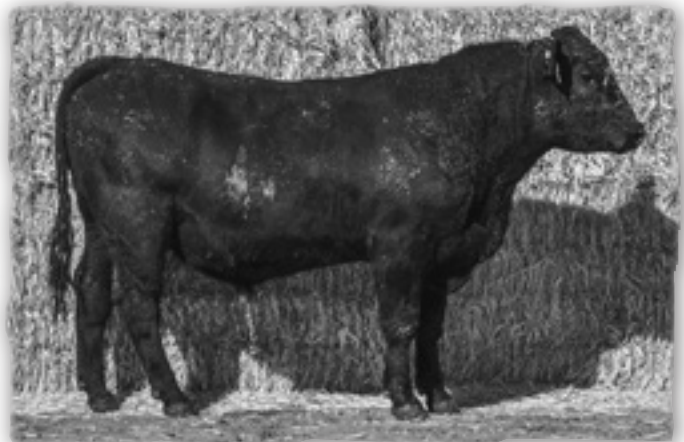
HD Dunn Absolute 7171 - Lot 40