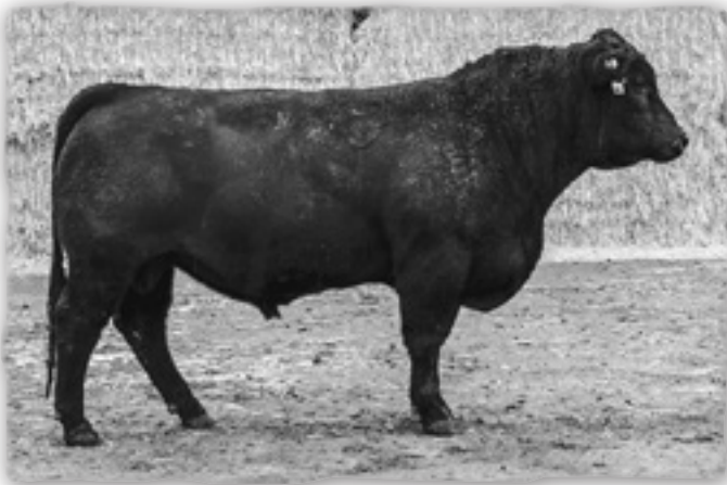
HD DUNN CHARLO E006 - Lot 110