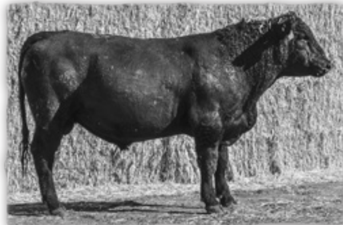
HD Dunn Great Plains 7038 - Lot 72