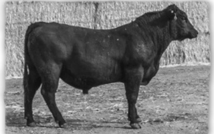
HD Dunn Final Statement 7265 - Lot 62