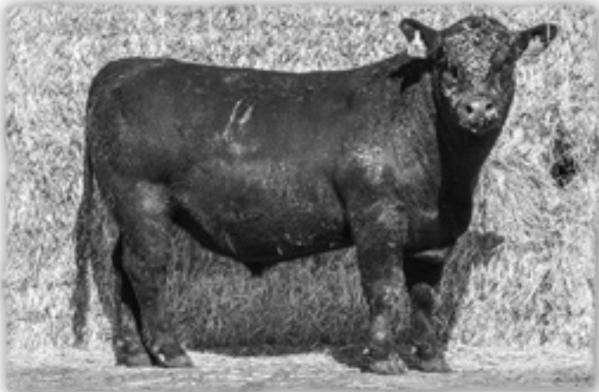
HD Dunn Absolute 7051 - Lot 3