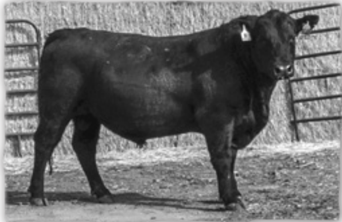
HD Dunn Charlo 7039 - Lot 10