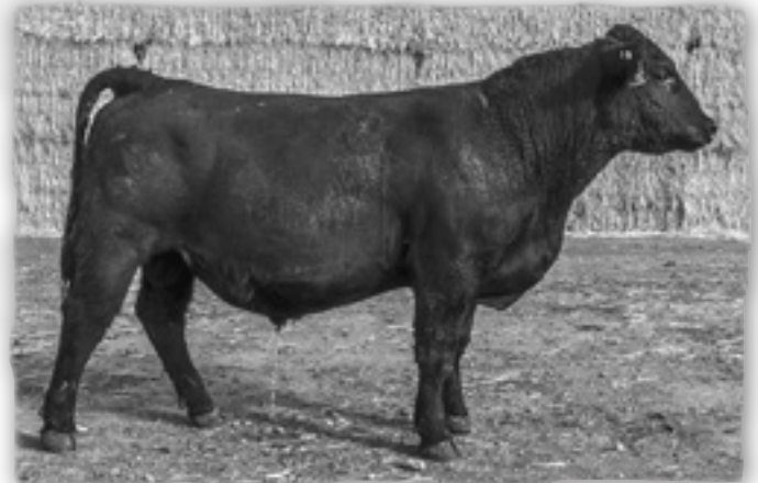
HD Dunn Absolute 7021 - Lot 7