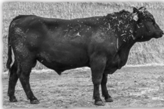
HD Dunn I87 Alliance 7341 - Lot 45